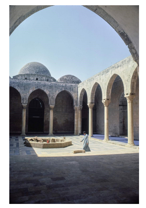
Figure 4. Courtyard of al-Firdaws Madrasa (1236), Aleppo, Syria.