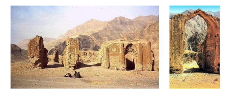
Figure 2. Remains of Shah-e Mashhad School (Glatzer, 1971).