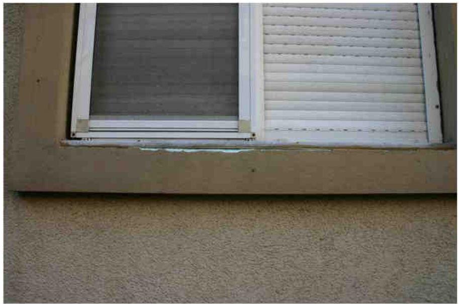
Figure 7. Exposure of thermal insulation material to the atmosphere due to wearing off the finish coat at BS-G

delamination due to defectively installation of an air-conditioning unit, drill holes etc were observed. Figure 7 presents an example of these types of defects; i.e. wearing off the finish coat and exposure of thermal insulation material to the atmosphere at the window sill due to improper detailing and construction.