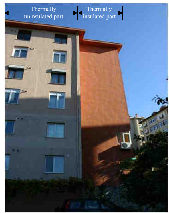
Figure 1. An example to the thermal insulation applications carried out during the initial periods of becoming a common practice – the left hand side of the facade is thermally uninsulated and the other part is insulated

investigations dating back to the year of 1975 in the countries where ETICS are widely used, presently there is no research regarding the long-term performance of ETICS in the conditions of Turkey, especially in terms of their durability, apart from other performance requirements such as indoor environmental comfort.