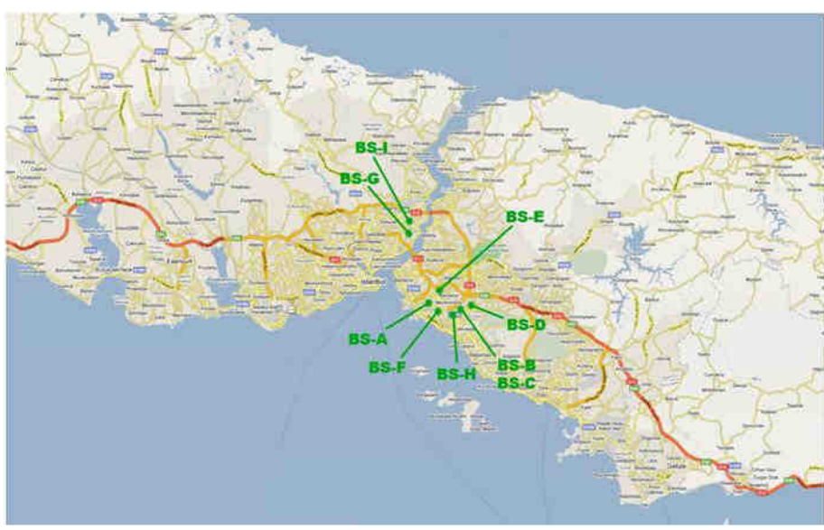
Figure 2. Location of inspected buildings with ETICS in Istanbul

Figure 2 displays the locations of the building sites, which have been investigated. Briefly, nine building sites and 44 buildings were inspected during this study. All of the inspected buildings were residential buildings. Regarding ETICS, mineral based finish and base coats with fiberglass mesh were commonly applied on either 3 or 4-cm thick extruded polystyrene (XPS) thermal insulation boards, which had been adhered and mechanically fastened to brick/block infill walls or reinforced concrete structural members as the substrates.