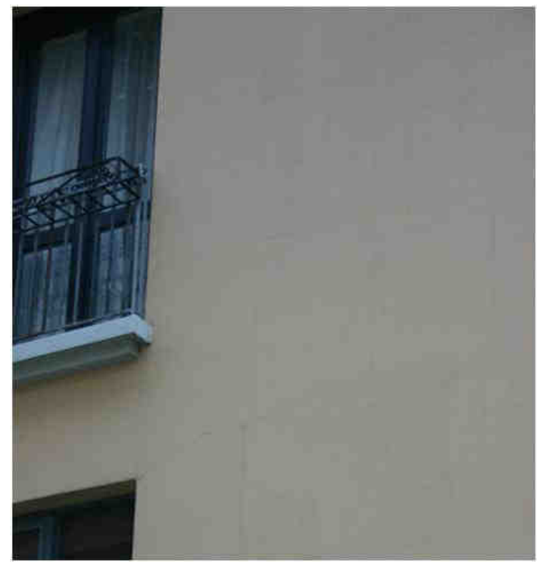
Figure 8. Example to the cracks observed in most buildings at BS-I

When exposed to external degradation agents of Istanbul, it is observed that, the state of the facades of the buildings with ETICS having an exposure life of 1 to 7 years proved to be "virtually without defects', even when facing directions of increased solar exposure and wind-driven rain load. However, the state of the facades of the buildings with ETICS having an exposure life of 12 years bared 'minor defects'. No apparent relation was observed among the intensity of the defects observed and the orientations of the facades that define the severity of exposure conditions, which cover the condition of being protected by other buildings as well. Investigations carried out on the interior surfaces of the facades with minor defects revealed that these defects had not caused any visible defects at the interior surfaces of the walls or had not decreased the thermal comfort of the interior space as expressed by the users. This suggests that such defects do not have any influence on the moisture or thermal performance of the XPS based ETICS when exposed to the external degradation agents of Istanbul for a maximum of 12 years. It is observed that maintenance of ETICS was not a common practice in buildings with ETICS as well.