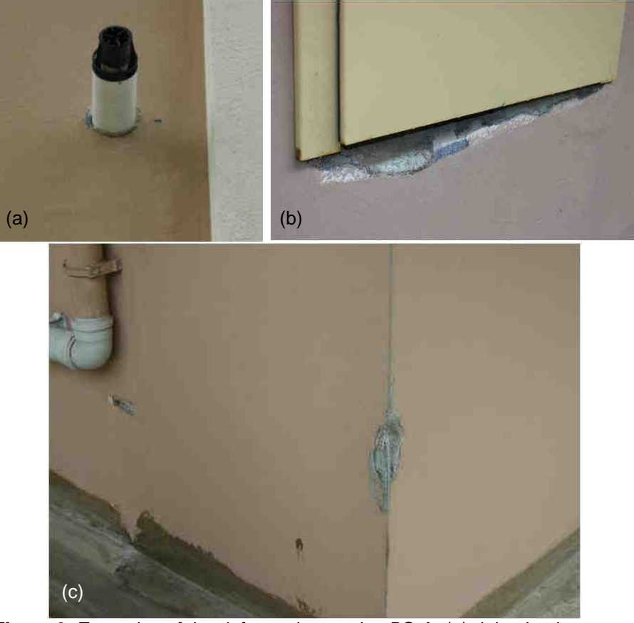
Figure 3. Examples of the defects observed at BS-A: (a) delamination at wall-pipe interface, (b) wear off at wall-closet interface, (c) delamination due to impact load.

In BS-B, four of the several buildings, which are nine to ten-storey high, have been thermally insulated with XPS based ETICS in the year of 2006, nine years after the initial construction. Limited numbers of isolated cracks such as small groove cracks that are hardly visible with binoculars were observed during inspection. Therefore, the facades of these buildings were classified as 'virtually without defects' and "without defects" under the assessment groups 1 and 2, respectively.