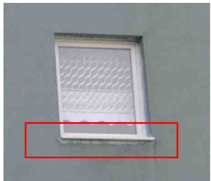
Figure 4. Exposure of thermal insulation material due to renewal of window frame and sill at BS-C

to improper construction work (Figure 4), and hence the facades were classified as 'with defects' under the assessment group 2.