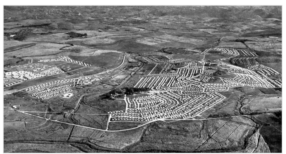
Figure 3. The township of KwaMashu, near Durban in 1959 (Maasdorp and Humphreys:1975)

Calderwood does suggest that humanising the inevitable monotony of the township is necessary, proposing that this be achieved through landscaping and the encouragement of individual private gardens. This vision and approach is of course reflective of the Modernist position articulated by Le Corbusier in moving from his perception of the 'pre-machine age Garden City' to the modern world with cities set in vast landscaped parks modelled on his Ville Radieuse. It is also evident in the work of Ernst May and his approach to the design of his Frankfurt housing schemes of the 1930's, involving the definition of a limited number of housing 'types', able to be mass produced using industrial methods (Bullock, 1978).