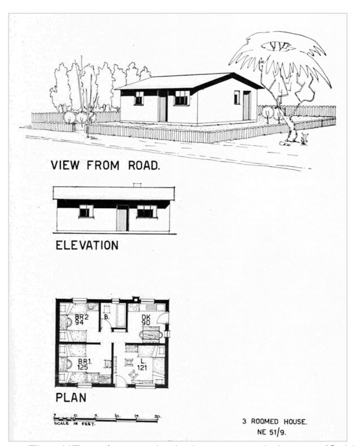
Figure 2. The NE 51/9 standard three-roomed house (Calderwood, 1953:31).

Necessary cost economies are seen to be essential, although this is seen as an advantage because '...they prevent unnecessary ornamentation and force the selection of good materials which require little maintenance, and they tend towards efficient design in terms of function...' (Calderwood, 1953:43). Although higher standard housing can be considered where subsidies are provided, Calderwood (1953:43) cautions against this by citing Walter Gropius: 'Subsidies do not lead to a real solution of the housing problem. They are to be considered only as a measure of transition...'