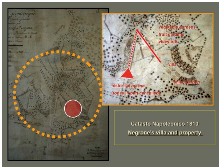
Figure 2. Negrone's villa and property (Catasto Napoleonico, 1810).