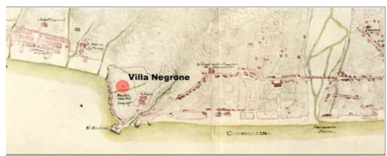
Figure 1. Villa Negrone (Vinzoni, 1773).

The urbanization and the realization of the esplanade of the Erzelli (project ITT) have modified the hydrologic system interrupted and destroyed the complex system of collecting and canalization of the spring waters along the walls of the property of Villa Negrone. Part of the agrarian landscape of Villa Negrone has been transformed in a "urban jungle" hardly accessible and difficult to be passed through due to the tangle