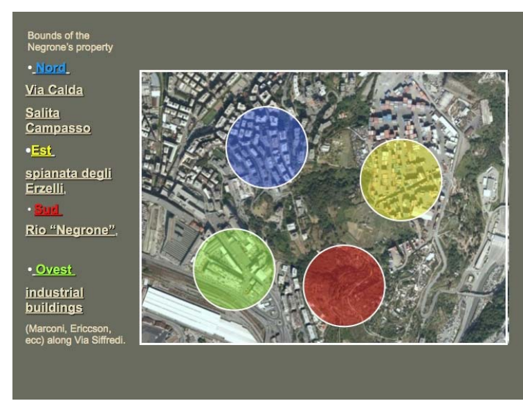
Figure 3. Bounds of the Negrone's villa.