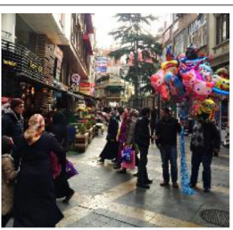
Spatial Insinuate: Revolt