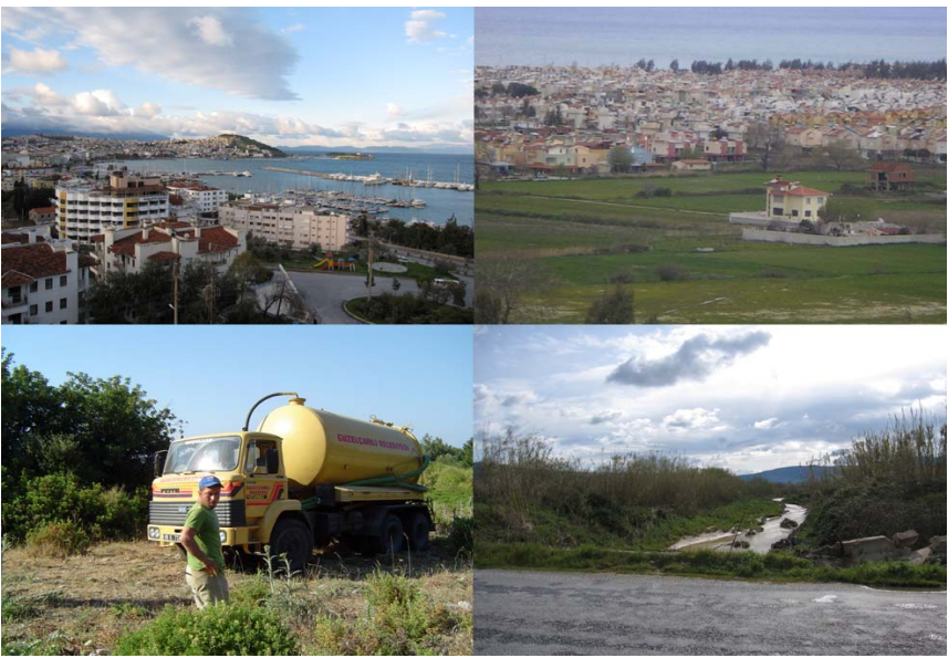
Figure 2. Views from Kuşadasi; Kuşadasi harbor and business district (upper left), summer house developments on agricultural land (upper right), illegal waste dumping of Guzelcamli into the adjacent national park (lower left), and increasing pressure to natural patches and corridors by urban and agricultural uses (lower right).

Guzelcamli borders with one of Turkey's oldest and ecologically important national parks, Dilek Peninsula-Big Meander Delta National Park. Dilek Peninsula part of the national park (10985 ha.) was declared in 1966 and Big Meander Delta (16690 ha.), south of the peninsula, was added later in 1994. The Peninsula is a "Flora Biogenetic Reserve" based on the European Council's European Biogenetic Reserve classification, and the Delta is an "A Class Wetland".