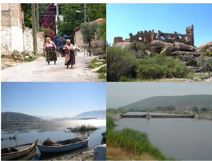
Figure 4. Views from Bafa Lake; traditional village living (upper left), ruins of ancient city of Heraklia (upper right), pollution in the lake (lower left), a regulator structure to control water flow to Bafa, GDSHW's solution for environmental recovery of Bafa.