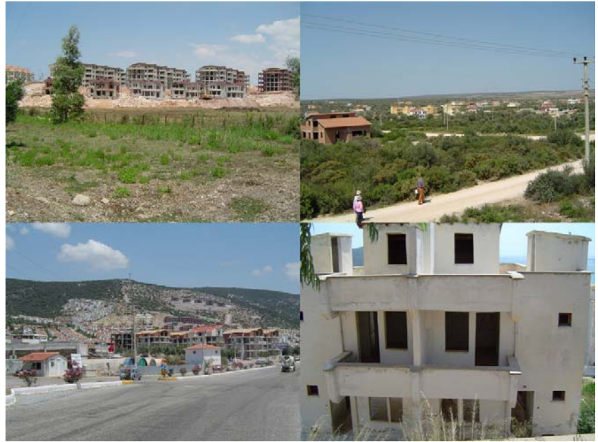
Figure 3. Views from Didim area; a typical summer housing project in Didim (upper left), new developments fragmenting landscape towards Bafa (upper right), edge effects created by summer houses in Akbuk (lower left), decaying of never utilized summer houses.

The national park, specifically the Big Meander Delta section, also neighbors with Didim on the south. In addition to this, Didim is surrounded by other sensitive ecosystems such as the Aegean shoreline to the west and south, and the Bafa Lake Nature Park to the northeast. The town is the fastest-growing urban area in the Aydin Province of Turkey. The population density in Didim is approximately 507 person/square kilometer. For a long time, Didim was a small village whose economy relied on agriculture conducted in the peninsula's relatively infertile soils. Since 1990, when Didim was discovered by tourists seeking a modest vacation in an area with a nice climate and attractive beaches, the economy has changed significantly. Also, the landscape characteristics of Didim have changed rapidly by housing developments (Figure 3). The first-class Altinkum beach, various ancient historical sites such as the Temple and Oracle of Apollo, and a comfortable climate that is especially soothing for asthma patients, have been major reasons why Didim became an attractive tourist destination.