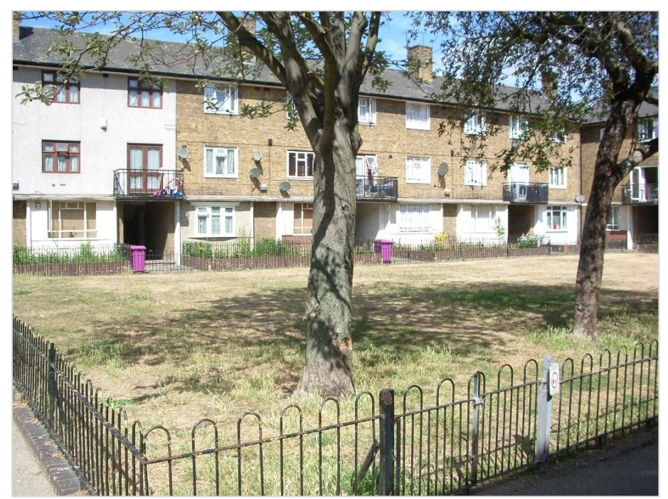
Figure 1. Neighbourhood court in Lansbury, East London, planned and constructed for the 1951 Festival of Britain.

tame affair', pronounced the RIBA President in opening the multi-national display of images at the Royal Academy's rooms in Burlington House, Piccadilly (RIBA, 1911, 733). The ulterior agenda here was less the free interplay of innovative design ideas than furthering the interests of the British architectural profession in implementing planning reforms (Whyte, 2011). The same dialogue between national and international concerns might be read into later events; virtually all the congresses of the International Garden Cities Association founded in 1913 and transitioning into the later International Federation for Housing and Town Planning had exhibitions running in parallel. The RIBA Conference also spawned smaller events across Britain as the workings of the pioneering Housing, Town Planning Etc Act 1910 were debated and imagined (e.g. Adshead and Abercrombie, 1914).