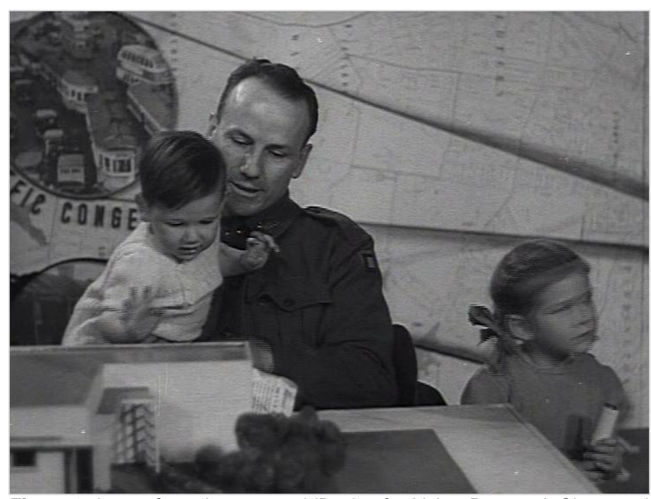
Figure 3. Image from the newsreel 'Design for Living Post-war', Cinesound Productions, 1944.

way focused on the important nexus between housing, neighbourhood amenity and planning reform in post-war reconstruction. The target here was government and private industry as much as the ordinary citizen. The indebtedness to those who had fought in the war and who would have to be accommodated in new healthy, efficient and attractive communities is manifested by the prominence of a returned serviceman with his children in a special short newsreel made on the exhibition (Figure 3).