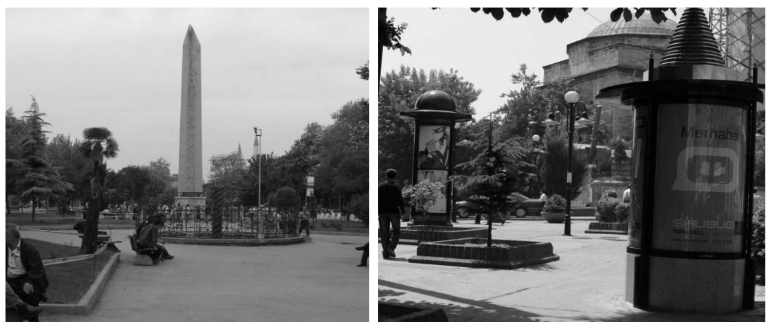
Figure 1: Sultanahmet Square-Obelisk

would be temporary, permanent, directly functional for urgent needs, or a mixture of all. The decision on the urban furniture, which will become a self for the urban space, is made according to the size of the space, the developments in the environment, the socio-cultural status of the inhabitants, and most importantly, on the integrity of urban identity.