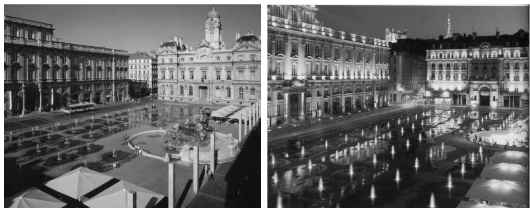
Figure 7: Place des Terreaux