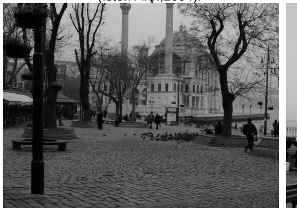
Figure 3: Ortaköy Square

The urban identity in " Sultanahmet Square " holds together and embodies quite diverse historical buildings and cultures. In order not to cast a shadow on the monumental character of Hagia Sophia (sacred wisdom), which is a 5<sup>th</sup> -century building, the integrity of urban identity is preserved here by placing urban furniture distantly from the structure and without exaggeration in their number. The existence of historical monuments like the Obelisk, the Twisted Column, and the German Fountain in the area that surrounds the mosque, which the square is named after, and Hagia Sophia requires that there should not be incompatible urban furniture in the vicinity of these monuments. Again, the natural surroundings hide certain defects in the area (İston A.Ş.,2004).