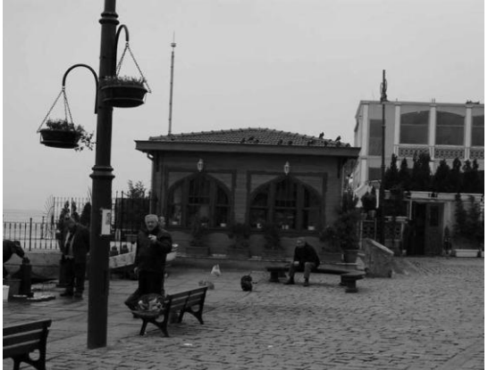
Figure 4: Ortaköy Square