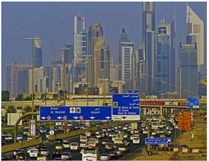
Figure 4. Traffic Congestion in Dubai.

If we move from the past, straight to the future, we can think and reflect more about the future of Islamic architecture and the Islamic "globalized" culture. Future means innovation and more investigation to achieve creativity. For the time being, the image of cities in the Arab world is sometimes confusing and sometimes considered chaotic. There is a huge threat and a continuous move toward unidentified standards of modernity in architecture in these areas and cities. We can even go further into identifying such architectural themes as the "non-style" or maybe the "free style" or also "non-cohesive style". Proportions are not followed firmly, materials are not matching and are not created within a general palette and the spirit of the authentic space and style is being part of the past and getting replaced by the spirit of money and capitalistic souls.