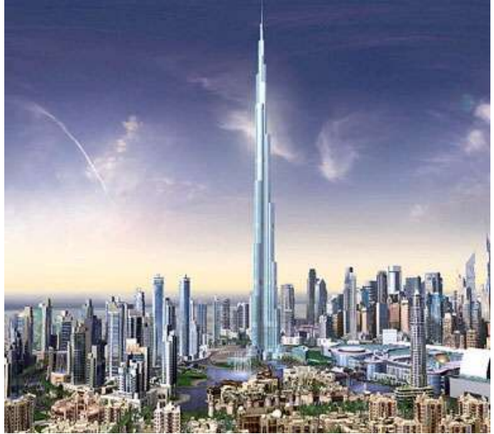
Figure 2. Futuristic Dubai.

human and social dimension to superficial boxes, with a strange and ill character. Dominant planning ideologies, and specifically modernism did not prioritize public spaces, pedestrians were neglected, and architectural trends have increasingly shifted towards remote, introvert and indifferent structures (Gehl, 2010). Breath-taking structures, high-rise buildings and shimmering skyscrapers resemble to an artificial pearl created in the middle of a wide gulf and a desert, where nature is forgotten and trapped inside the urban jungle. Large bay windows, great views on the Arab Gulf, and a large-scale transparency are repetitively monotonous aspects of the whole urban scene. In those areas, people are living in a "fly-by" world, defined as a world of brands and capitalism. People are guests in their homes, and strangers in their own milieus. Scholars and academics in the Arab world agree that the only way out of the state of underdevelopment is to learn from the west and to assess critically our own values and beliefs- a fact made urgent in the post 9/11 era (El Sheshtawy, 2004).