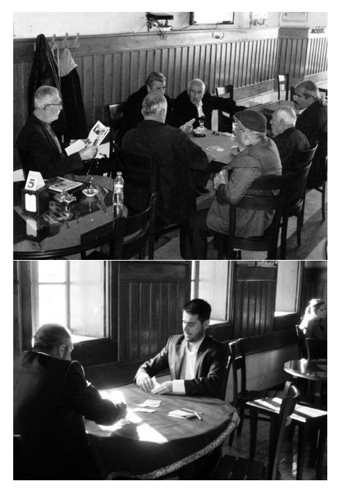
Figure 2. Tahmis Coffee House regulars.

one hand, the historical spirit of this public space is refreshed by its regulars, on the other hand, tourists and the young visitors of coffee house increase the fame of Tahmis. The regulars and young tourists share the same table today, listening to the personal memories of the elders'.