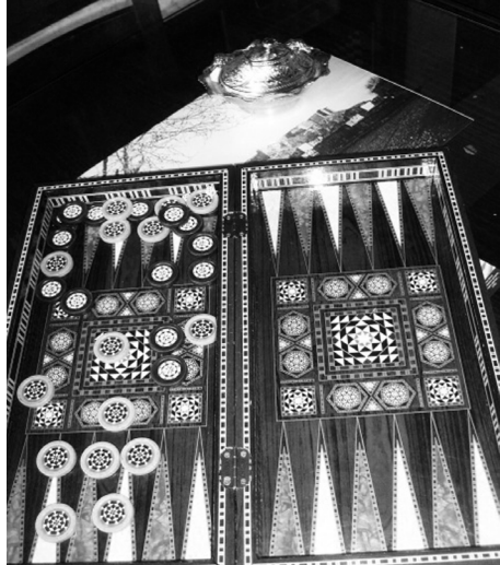
Figure 3. Puppets and pearl inlaid gammon.

intertwined with the oral narratives of Tahmis Coffeehouse regulars in order to understand the spatial practices of the coffeehouse users and the history of coffee culture in Ottoman cities from the very beginning of the coffee consumption in the sixteenth century. At the beginning of their establishments in the Ottoman cities, coffeehouses were used for religious conversations and thus, they were centered around the mosques. But in time, coffeehouses attached importance as public spaces of cities where people socialized and played games as well as spending free time. Also, the coffeehouses were transformed into celebration spaces where bairams were celebrated not only with regulars but also with people from all strata in the city.