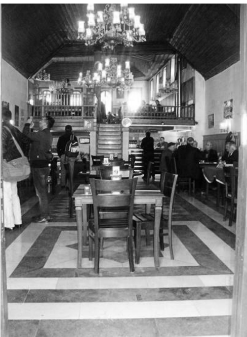
Figure 1. The entrance of Tahmis Coffee House and the ground floor.

method is used in Sultanhamet and Hagia Sophia. In contrast to contemporary isolation materials, wood is a living material which is good for the air pollution. It absorbs the harmful gases of cigarette smoke."3 "On the top of each arched door, there is a keystone, which is shaped as frusto-conical... When the keystone is cut, it is a soft material and as soon as it comes together with oxygen, it hardens. There are two types of the stone, the soft and the hard. The hard one is used in doors and window openings. Look, there is construction difference between this keystone and the stone on the wall. The latter is a yellow stone, which is harder than the other just like marble. The soft stone is called havara , which breathes and cankers in spring. These cankers called güherçile and used in making gunpowder. It is rare here but you can see more in Pürsefa Inn. You definitely know the Karataş region of Antep, where the best quality stone quarry is provided. There are two different types of stone quarried in Karataş. The first is a heat-resistant and spongelike stone and the second is a void-free stone. The latter cannot resist change in heat but it is very strong statically. Long ago, the latter was used in streets but nowadays, it is used for floor covering."4