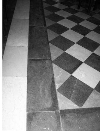
Figure 4. Stairs and floor covering made of Karataş.

connection here... No matter how authentic you are, it is necessary... Maybe the heating system could be made differently... There was a heating stove long time ago... Actually not in here but in villages, maybe you know, there are special structures called fireplace (ocaklık)... Tahmis is too big, maybe the heating could be made differently..."6 "Tahmis became modern in recent times... What is our traditional habit in bairams? In the feast of sacrifice, blacksmiths singe the head of the sheep in order to burn hairs... This is a traditional habit... But in this bairam, polices banned this routine... For the sake of tourists! But tourists come here to see out traditional celebration behaviors, routines and rituals..."7