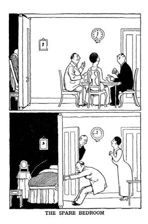
Figure 2. Robinson's representations of modern kitchen and a flexible room (Robinson & Browne, 1936/2014).

to the spaces through satire. The first of the striking images is about the kitchen space, which many architects have drawn on and produced examples. Corbusier's famous 'machine simile' mentioned in the background section and his approach to areas before-mentioned as kitchens are examples of these productions.