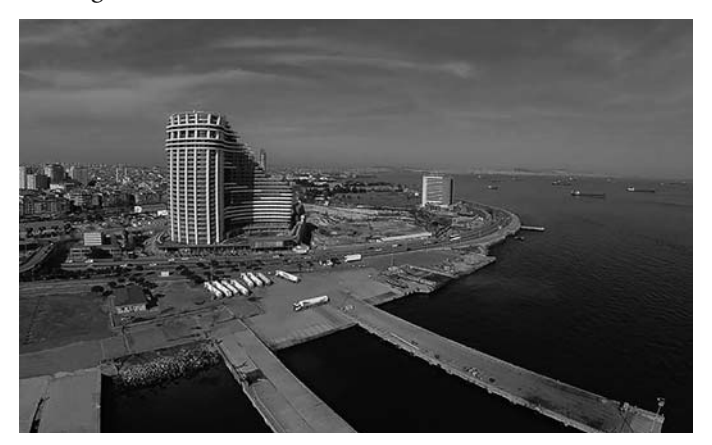
Figure 10. The image showing the location of Ottomare suites in urban area.

areas, social facilities and sports facilities, professional hotel services are other functions in the project. Social facilities and services accompanying the function of the residence in the building possessing many of the specialized residence services are reflected as the signs of high standart life image.