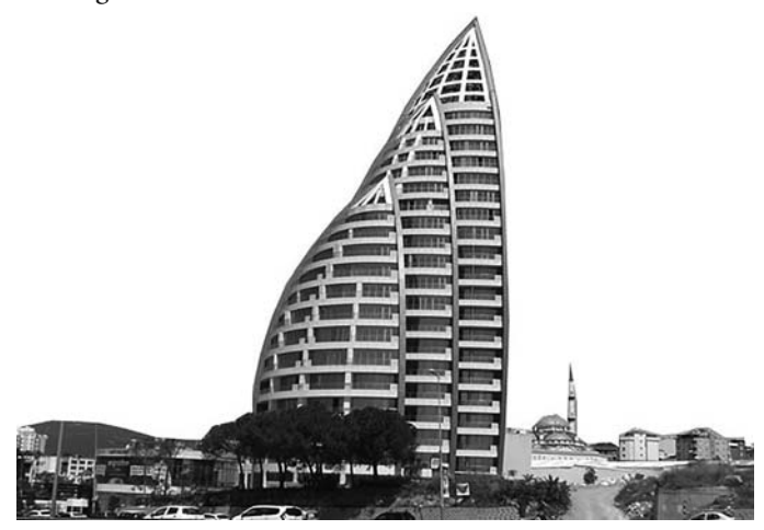
Figure 6. The image showing the location of Safi Espadon in urban area.

tions, Safi Espadon reflects sculptural and dynamic lines with finished form image in the design of residential tower. The building has an architectural image that displays itself as a symbol high-rise. In the context of the order parameter, the housing blocks appear to be sitting on a symmetrical and axial plane. In addition, the order of residential blocks provides different facade views and landscapes. The architectural structure has been analysed in three parts in terms of facade-mass relations. It is observed that the triple housing tower is sitting on a basement where secondary functions and social areas are located in the entrance section of the building. It is designed with the same planimetric form of segments for residential functions. The main body consists of three residential blocks, each having different sizes. The pointed ends that give the structure sail form are the roof part of the structure made of steel construction in triangular prism shape. In the massive rhythm , three different size of blocks come together to create a single form, which