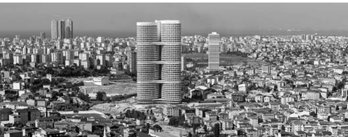
Figure 8. The image showing the location of Dumankaya İkon in urban area.

tel and office buildings in recent years due to the need of luxury living in the city center. Ottomare Suites is a mixeduse high-rise project in Zeytinburnu, which transforms the silhouette of the city.