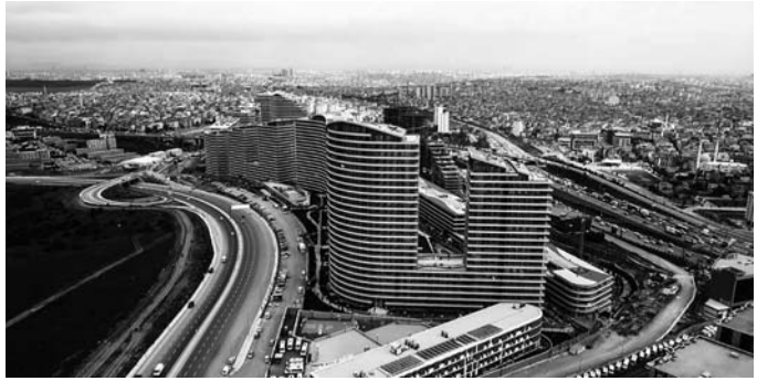
Figure 4. The image showing the location of Batışehir in urban silhouette.