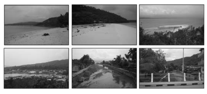
Figure 3. The condition of natural landscape mountains blend of Donggala city, white sand beaches and rivers in one city.