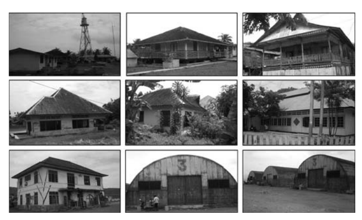
Figure 2. Various artifacts of historic building of the kingdom and Dutch colonial form: lighthouse along with his watch-house facilities, traditional buildings, the king's house, official house resident, a Chinese school, office buildings and warehouses HET Koprafonds.

This phenomenon is more interesting to be studied by looking at the historical development of Donggala strands as the Banawa Kingdom city's rule and Dutch which once served as the Port city ever famous on the world map. Accumulation of the transformation of the spatial fabric in the past to the present is exactly shape and give a distinctive character to the functions of city life in the process of signification of Donggala identity (Amar, 2000).