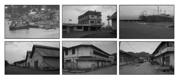
Figure 4. Donggala port conditions with a variety of facilities and buildings in the form of building artifacts Doane (customs duty), port warehouses and docks Dutch colonial heritage, and the faces of Old Donggala city around the port.