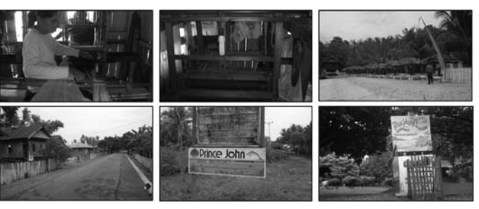
Figure 5. Socio-economic conditions and cultural city of Donggala which tend to be based on travel support activities, among others: the manufacture of woven fabrics of silk Donggala using loom machines, traditional fishermen, and the provision of facilities such as marine tourism resort and diving.