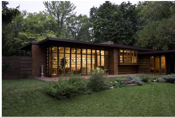
Figure 1. First Jacobs house (Lind, 1994).

Even though, Wright's Jacobs Houses and Broadacre City, technically, are mostly old and already well known in-