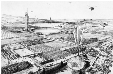
Figure 3. Broadacre city perspective drawing by Wright (Pfeiffer, 2009).