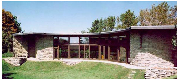
Figure 2. Second Jacobs house (Lind, 1994).

formation for contemporary architecture, his perspective could be a debate against an Anthropocene point of view in architecture. Banham (1969) identifies Wright's architecture as a liberation of the limits of static architecture and an approach to form a natural flow of being. It could be described as a reconcile between modern human and nature. Wright (1957) thinks native American life is more free and natural. He describes being native with being with nature: