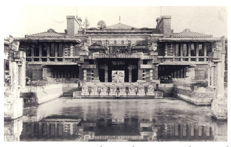
Figure 3. Imperial Hotel in 1923 designed by F.L. Wright (Archives, Tokyo Prefecture Government).