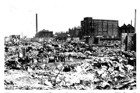
Figure 4. The Great Kanto (Tokyo) Earthquake in 1923.

In the case of Shiodome District Redevelopment 2003, the previous site was the first train station 1872, and its previous land use was a railyard. Some private sectors hired several distinguished foreign architects such as Kevin Roche, US, for the office building invested by