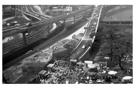
Figure 8. Major Trunk Road for the Tokyo Olympic in 1964 (Archives, Tokyo Prefecture Government).

the Singaporean fund, Richards Rogers, UK, for the TV station, Jean Nouvel from France for the largest advertising company. It looks like the same situations as the Meiji Renovation of 1868. Hired young foreign architects designed many important public buildings in the Meiji Period. Today, in this case, well known old, distinguished, established architects are hired for private buildings.