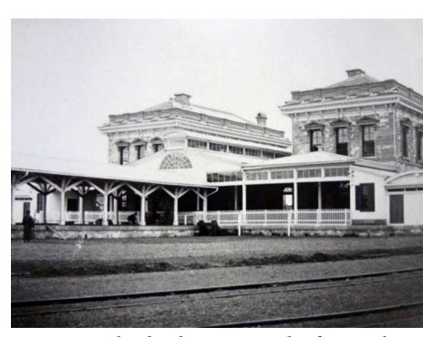
Figure 2. Shinbashi Station, the first railway station in 1872, by a British architect.