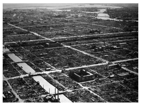
Figure 6. Air raids disaster in 1945.