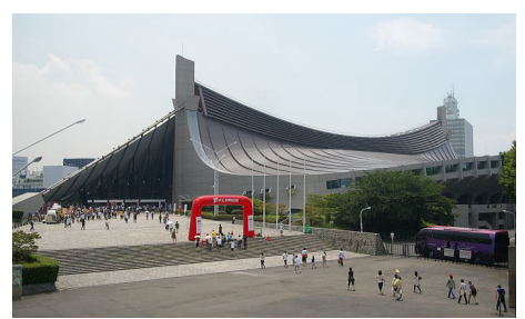
Figure 7. Olympic Stadium by Kenzo Tange, 1964 (Archives, Tokyo Prefecture Government).