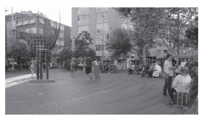
Figure 4. Mehmet Ayvalıtaş Square.