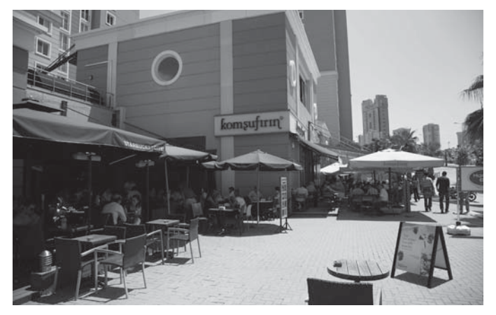
Figure 6. Ataşehir Avenue and cafes.