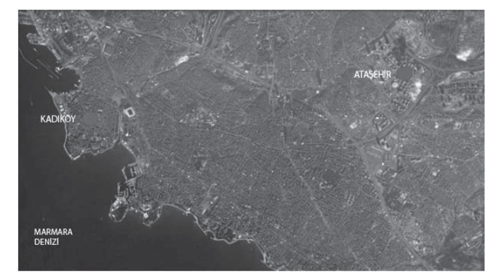
Figure 1. Location of sites of study in Kadıköy and Ataşehir

According to Sheller and Urry (2003), rather than seeing this process as "a straightforward 'colonization' of the public sphere by private interests" we should treat it in a much more complex manner, as a process of "de-territorialization of publics and privates". This new development is a much more complex form of organization in which all roles, rights, and responsibilities, from the design of spaces to their management, are shared between the state