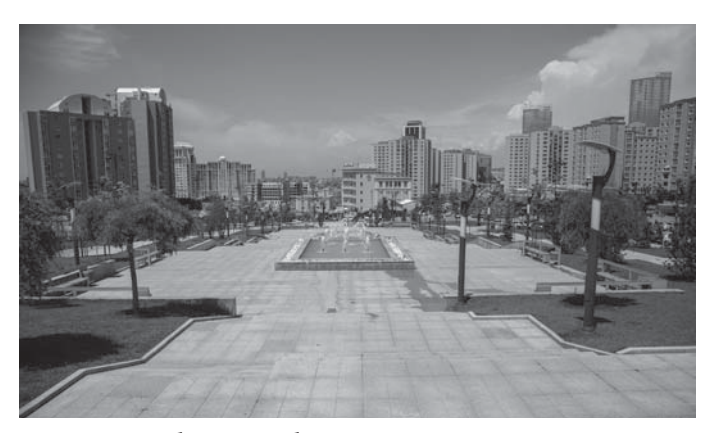
Figure 5. Cumhuriyet Park.