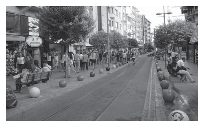
Figure 3. Bahariye Street.

The second step in the fieldwork was to conduct semi-structured interviews with people reached using the snowball sampling method, in order to comprehend the meaning of their surroundings for the ones living close to these fields in terms of their free time habits and to be able to touch on issues that could not be identified in the survey. In both sites, people were selected from