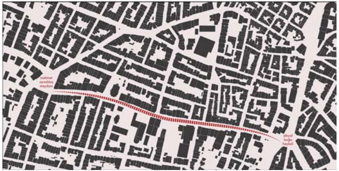
Figure 2. Urban fabric containing Bahariye Avenue and Mehmet Ayvalıtaş Square in Kadıköy