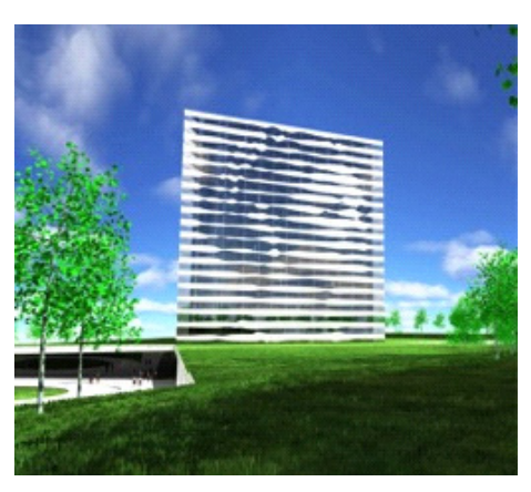
Figure 6. Arlanda Hotel, BIG, Stockholm, Sweden, 2007.

Ornament as the representation of culture has long been one of its primary applications. Ubiquitously seen in public buildings, especially in exposition constructions, ornament becomes a tool of public promotion and representation for commercial success. As Umberto Eco (1997) states, in an expo, architecture emerges first as a message,