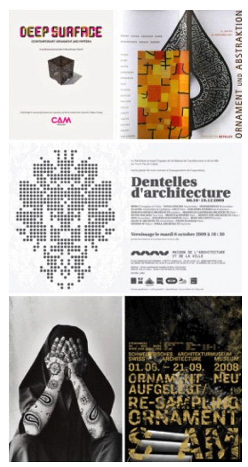
Figure 1. Posters of selected exhibitions: Deep Surface: Contemporary Ornament and Pattern, Ornament and Abstraction, Lace of Architecture, The Power of Ornament, ReSampling Ornament.

In the last decade, the emergence of a vast array of exhibitions, journals, and books indicate the current interest in