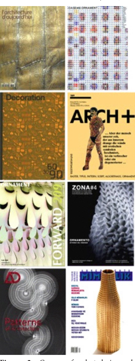
Figure 2. Covers of selected journals: L'architecture d'aujourd'hui (2001, No. 333), Oase (2004, No. 65), 306090 Books (2006, No. 10), Arch + (2008, No. 189), Forward (2009, No. 2), Zona (2009, No. 4), Architectural Design (2009, No. 6), Arredamento Mimarlık (2010, No. 241).

ture, elaborating its historical overview, specifically in the "Ornament" issue of Forward (2009, No. 2), "Ornament: Return of the Repressed" issue of Zona (2009, No. 4), "Patterns of Architecture" issue of Architectural Design (2009, No. 6), "Pitch, Type, Pattern, Script, Algorithm, Ornament" issue of Arch + (2008, No. 189), Werk, Bauen + Wohnen (2007, No. 11), "Decoration" issue of 306090 Books (2006, No. 10), Eye: The International Review of Graphic Design (2005, No. 58), "Ornament: Decorative Traditions in Architecture" issue of Oase (2004, No.