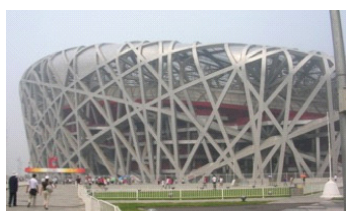
Figure 9. Beijing National Stadium, Herzog & de Meuron, Beijing, China, 2008.

From outside, the façades perform as a veil by means of the overlapped patterned glasses. Creating a moiré effect, façades draw the attention of passersby, allowing them to have a glimpse of interior at some points. Playing with the opacity of vision, the façades represent the building function by imitating the moiré effect of Louis Vuitton, as much as they turn the brand identity and the need for advertisement into ornament.