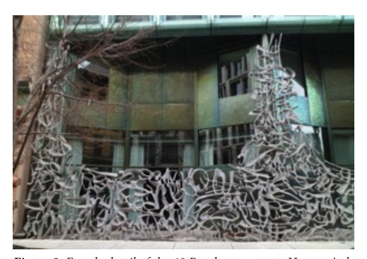
Figure 8. Façade detail of the 40 Bond apartments, Herzog & de Meuron, New York, USA, 2007.

One of the essential applications of ornament today relates to the aesthetics of consumption. The Louis Vuitton Store in the 5th Avenue of New York, built by the Japanese architect Jun Aoki in 2004, can be attributed as one of the contemporary conceptions of the decorated shed (Figure 7). The 1930 building by Cross & Cross, in which the store is located, is clad with glasses that were ornamented with the famous checkered pattern of the brand.