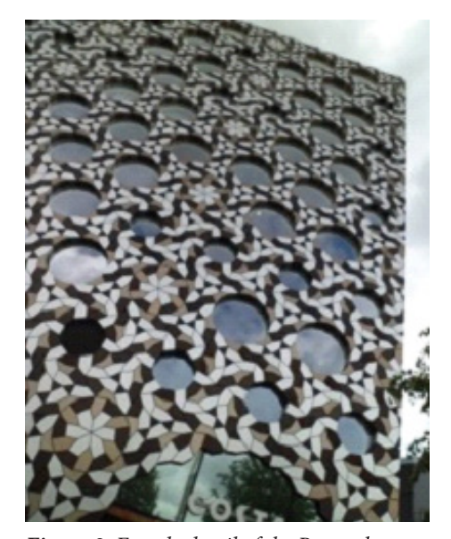
Figure 3. Façade detail of the Ravensbourne College, Foreign Office Architects (FOA), London, UK, 2010.

Ornament in contemporary architecture emerges as an elaborate medium of consumption and production by means of new tools, methods, and techniques. The idea of seamlessness and fluency becomes the current par-