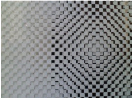
Figure 7. Façade details of the 5th Avenue Louis Vuitton Store, Jun Aoki, New York, USA, 2004.