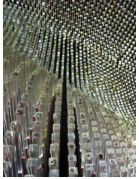
Figure 5. Outer and inner details of the UK Pavilion, Heatherwick, Shanghai, 2010.