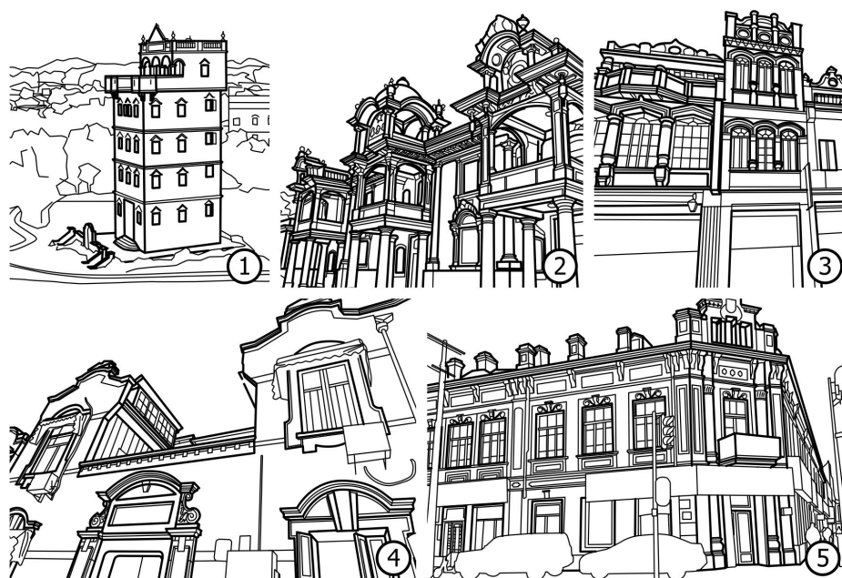
Figure 1. Sino-western styles: 1) diaolou (Jiangmen, Guangdong province); 2) weilou in sino-western style (Meizhou, Guangdong province); 3) qilou (Haikou, Hainan province), 4) shikumen (Shanghai); 5) Chinese baroque (Harbin, Heilongjiang province).

Zhu Ying, etc The fundamental analysis was based on cartographic and photographic materials. The contemporary planning stage has been studied with the help of analysis the found trends in the works of P. Schumacher, Iu. S. Iankovskaia, L. Sklair, S. P. Pomorov, and others. The phenomenon of imitation of global trends in design without understanding or use of their technology and methodology has been analyzed on the basis of factual material of educational course design and actual planning activity.