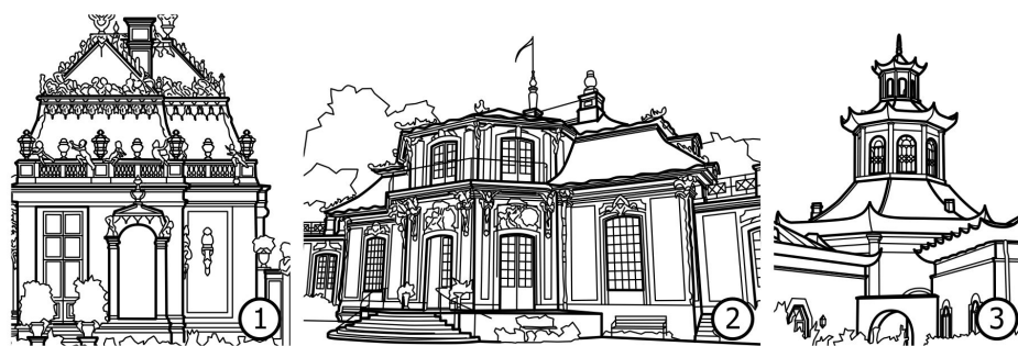
Figure 2. Chinoiserie: 1) Trianon de porcelain in Versailles (France); 2) Chinese pavilion in Drottningholm (Sweden); 3) Chinese village in Tsarskoye Selo (Russia).

even on the stage of development. In addition to mentioned before galleries of Chines baroque that developed from the balconies, such examples are found in diaolou where the parapet of terrace was transformed into the wall of spirits (yinbi), or the likeness of moon gate (yueliangmen). The design of the pediment and platband above the entry gates of shikumen and window apertures in diaolou, weilou, shikumen in some cases were designed in the form of stylized Chinese traditional roof or pailou gate (Luckova & Kim, 2016).