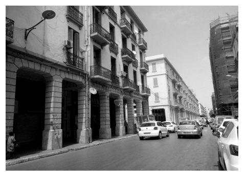
Figure 4. View on rehabilitation of buildings, located on Larbi Ben M'Hidi Street.

<sup>12</sup>OPGI is the local (national) abbreviation of: the Office of Promotion and Real Estate Management.