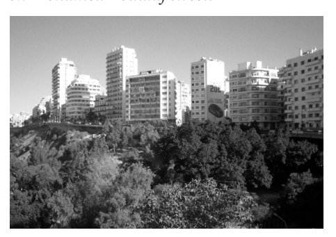
Figure 3. View on buildings of modern style, located on the seafront boulevard.

them in the hearts of islets. Their architecture is sometimes in a neo-classical style and sometimes in an eclectic style, using columns, pilasters and cornices (Figure 2). They seem to be repeated along the streets, but they are distinguished by few accents in the drawing of their facades and the design of their differentiated angles. In fact, the concern for creativity has been exerted on detail in the form of the ornamentation and the expressiveness of the structure elements (capitals, columns, ...). In addition, regulations in effect, based on general provisions: alignment on street, the contiguity, the courtyard, the height of building proportional to street width, respected by the builders and the owners, has been at the origin of the production of a landscape of a great urban and architectural unity: "Urban architecture [...] depends until the twentieth century less from a cod-