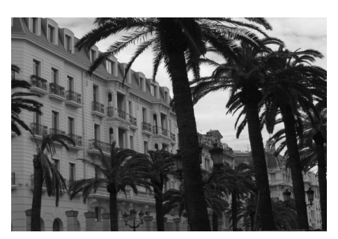
Figure 9. View of a pseudo-historical contemporary building, the "Royal" hotel, located on Boulevard de la Soummam.