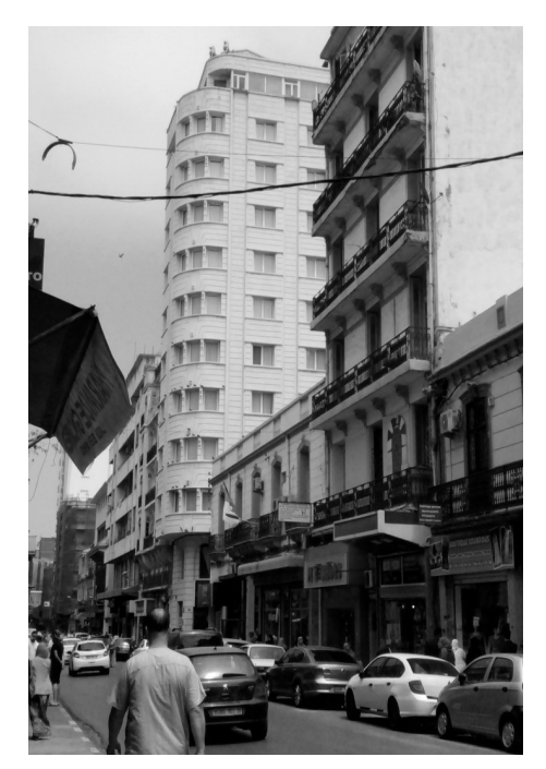
Figure 7. View on the hotel "Oran-Center", located on Larbi Ben M'Hidi Street.

The advance of the building in cantilevered, increased the thickness of its facades of 150 cm, winning at each level, a surplus of surface, and a fully open facade more enlightened on the narrow transverse street. On its outer envelope, the openings are pierced, in a traditional way, skilfully superimposed over the whole height of the building. Their size and design do not express any space particularity. In contrast to the "CNEP" office, the exterior of the hotel assumes the full without creation and translates the horizontal closing, whose the continuity between the inside and outside of the building. The imposing height of the building, transgresses the urban regulations in force, and doesn't change from one street to another (Figure 7). The rounded corner of the building is designed without any special features. An effect of verticality of the casing is accentuated, to the detriment of the perspective effect on street. In appearance, the building is simple, integrated, but it is also shifted, it seems to have always existed in