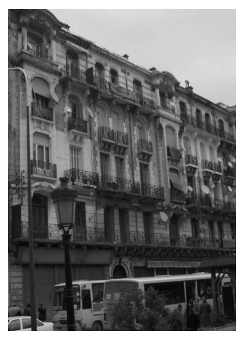
Figure 2. View on eclectic buildings, located on Mohamed Boudiaf street.