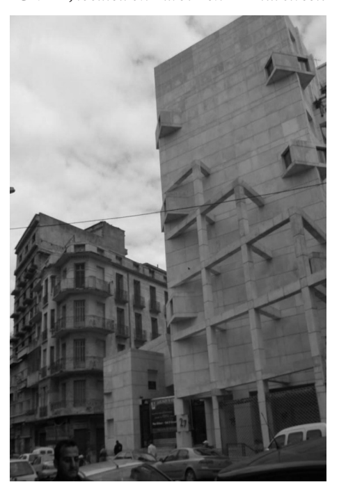
Figure 6. View on Residence Clementine, located on Mohamed Boudiaf Street.

beige stone, marks the entrance to the building. Above this base, the building rises on six other levels, its outer-envelope is completely glazed, expressing the nature of its function and its need for the maximum light. The metal structure of the building has been maintained setback to create the curtain wall, which the effect of drawing highlights level of each floor forming the office, assimilated on the facades of pre-existing buildings, marked on the one, by the cordons and in the other by the protrusions of balconies. The transparent façade of this building is in dissent with the masonry wall pierced with windows of surrounding buildings. It should be emphasized that: "the Building with continious glazed wall is a fruit of the American technological culture" (Fanelli, 2008, p.39).