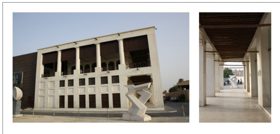
Figure 4. Re-dignified historical vernacular: Bin Matar House in Muharraq (Source: Author).

Isa House; once the home of the Amir's great-grandfather, Shaikh Isa bin Ali Al khalifa, and Siyadi House, built by the pearl merchant Ahmed Bin Qassem Siyadi. They provide the significance and ambience for the location, while the narrow alleyways and other elements prevalent in the area add to this ambience. These elements represent a balance between sensitivities to climate and needs of privacy with fine, exquisite internal ornamentation to counter the barren desert and create pleasant and habitable spaces. In re-dignifying the 'heart of the nation', specific historical vernacular carefully chosen from the former residences of the sub-elites have been renovated, and re-presented having been re-glorified by means of documentation, renaming, and by celebratory events being organized there. The buildings and spaces show the numerous traits that Bahrainis would cherish and celebrate as uniquely theirs.