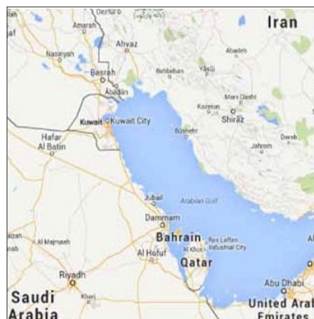
Figure 1. Bahrain- the location amidst 'other' culturally similar nations (Source: Google maps).