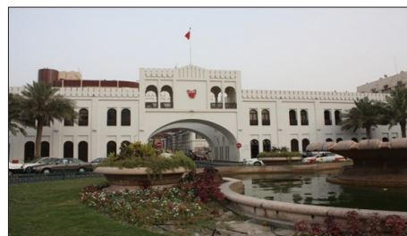
Figure 2. Bab-Al Bahrain-the gateway to Bahrain (Source: Ministry of Culture, Bahrain).

Since the discovery of oil, Bahrain has moved across many fronts to construct a sense of statehood and a nation, through the construction of national symbols or the promotion of reconstructed historical narratives. They have endeavored to assert their social and cultural uniqueness and construct adequate representations through material culture. The search was for styles in the arts and architecture that was inherently their own, which reflected true "Bahraini identity", and opposed those trends raging in Europe, particularly those of the British, which had begun to influence Bahrain as a British Protectorate. However, its first production of "national" architecture—the Bab-Al-Bahrain, or the gateway to Bahrain—was also designed by a British surveyor: Belgrave. Built in 1945, centrally located as an entry gate to the Manama Souq, Belgrave attempted to localize a predominantly British-style building by introducing arches and recesses around the windows. The traditional Bahraini roof parapet and motif details transformed to fit in with the style of the building was a feeble attempt to balance the fusion of an alien style to the vernacular styles of Bahrain. With the sense of national identity taking a more articulated form, its inadequacy as a national monument was strongly felt and, in 1986, it was decided to refurbish it in order to incorporate more powerful Islamic architectural features. Indeed, most recently in 2012, it has been rejuvenated together with the tra-