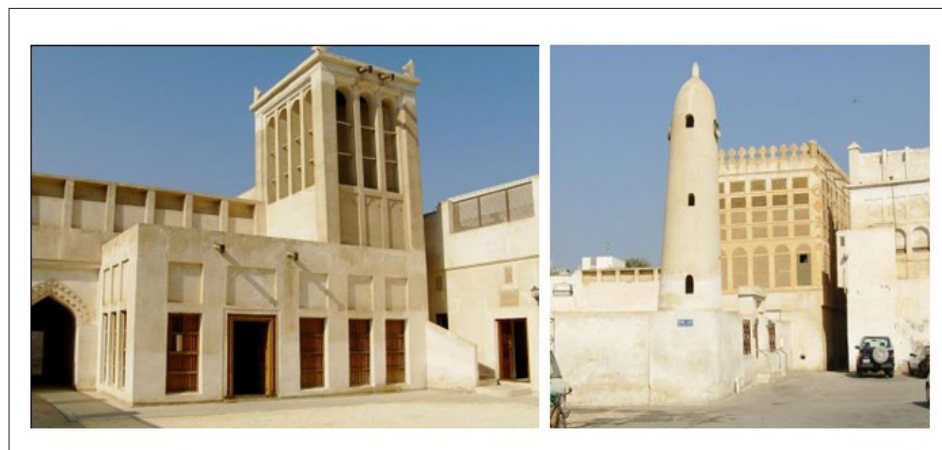
Figure 6. Isa Bin Ali House and the Mosque and bait Siyadi in the pearl Trail.

of those involved in the economic system' (Ministry of Culture, Kingdom of Bahrain), it is an entire neighbourhood that had come into being through intricate relations between the sub elites and the workers of the pearl industry. The two miles long pathway brings back the neighbourhood to life, glorifies and presents the everyday dwellings and places that had once represented the core activity of Bahrain that gave rise to its culture and defined the people of the island as pearl divers and seafarers. Among them is the house of one of the grand merchants, and a gamut of dwellings of those who took part in the pearling industry culminating in the house of a nukhida (sea vessel captain) family.