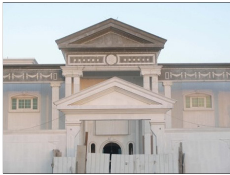
Figure 3. Imitated Palladian Villas – vernacular of the middle class seeking a new Identity in Bahrain (Source: Author).

Empire in the global south and led to similar outcomes. Of focus here are the practices that have evolved in the domestic architectural scene of Bahrain, which have been driven by individual fascinations, market forces and popular perceptions. At the beginning, many of the villas and residential buildings imitated Palladian architectural forms and symbolism in preference to the historical vernacular. In fact, symmetry in form, elaborate domes, pediments and porticos reminiscent of the Italian Renaissance were seen as legitimate forms that could establish the newly gained place in the world. The sub-elites were quick to abandon the traditional and the vernacular as they perceived these to be belonging to the past and not having the symbolism to project the newly acquired wealth or the flamboyance of the status of a 'rich nation'.