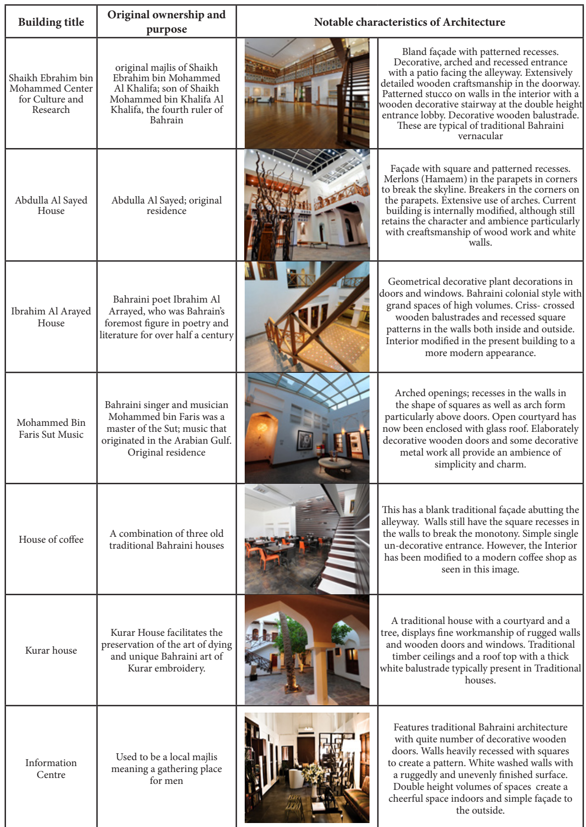
Figure 5. Vernacular of the elites and sub-elites representing the nation of Bahrain.