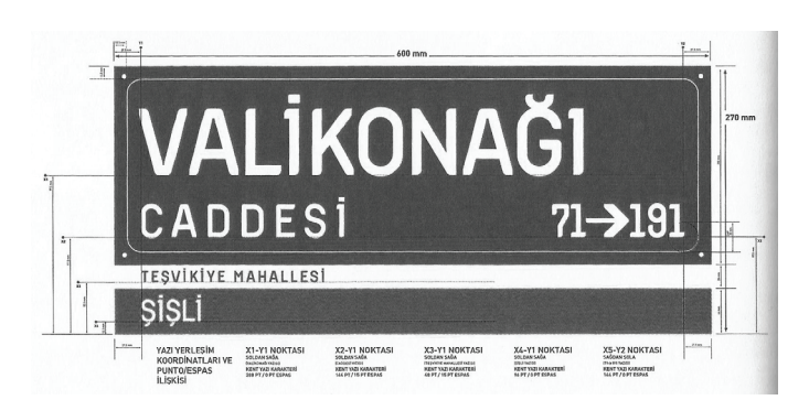
Figure 3. The street plates of Istanbul, designed by Bülent Erkmen and Aykut Köksal (Resource: Reading Istanbul from signs, Exhibition Booklet, Garanti Galeri, İstanbul).

The commercial communication forms and their physical representations mainly aim to create and impose their own terms and conditions rather than using existing geographical communication elements and reconciled urban semiotics. The physicalization and legalization of commercial communication (commercial names, commercial advertisements, etc.) in the city becomes possible and visible through the legal permissions with the use of "urban surfaces" (building facades, advertisement areas, billboards, etc.).