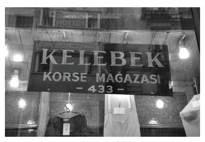
Figure 6. The commercial sign of Kelebek corset store (Resource: Photo taken by the author).

For an individual, the city is not only a text to be read but also a text to be written at the same time, if s/he experiences the city of Istanbul on foot by using the tactics of dérive and détournement as suggested by situationists during this practice and with the awareness that the communication elements of the city predominantly have a