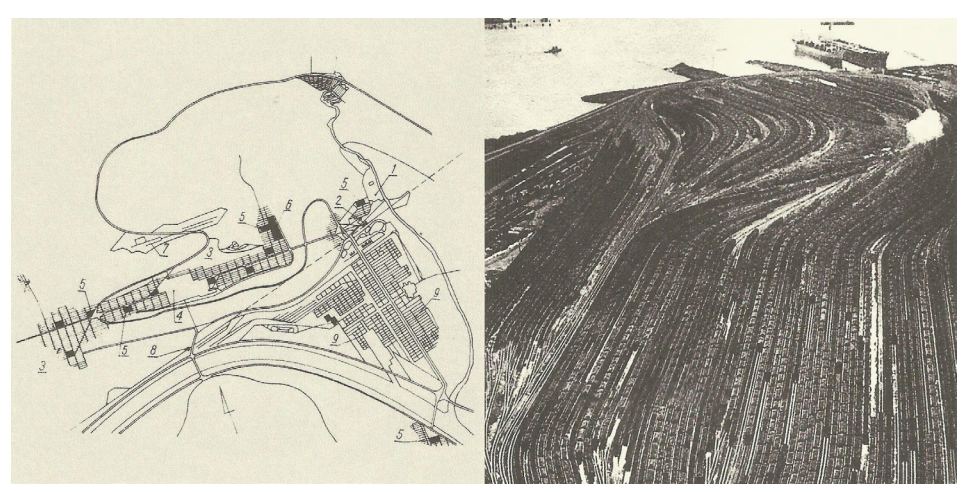
Figure 1. The representation of "layering" ("Sichtung") notion in two diverse metaphors (Resource: Morphologie: City Metaphors, O. M. Ungers, Walther König Publishing, Köln; 2011).

Explanations which suggest that the working class marches taking place on streets later served as a practice to win the power struggle (Pravda Newspaper, 1976) propose to benefit from the potentials of speed and masses. In this regard, the speedy and sporty activities of the 68 youth are considered as tactics. Also at the end of 1970s, the well-trained militant mass in Japan, well-equipped with audial-visual