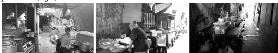
Figure 6. The combination of the sharing and extending of space.