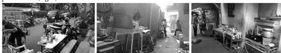
Figure 5. The extending of space with required permission (left & center) and no required permission (right).