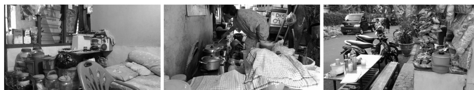
Figure 2. The practice of the shifting (left), sharing (middle) and extending (right) of space by processed food vendors.

Most of the HBE owners (72.22%) opted for extension of space as their spatial strategy in accommodating domestic and economic activities. The sharing of space is the moderate option (22.22%) and the shifting of space becomes the least option (5.56%)