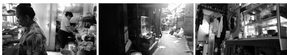
Figure 4. The sharing space with required permission (left & center) and no required permission (right).

These examples demonstrate the usage of public space, which may cause circulation blockage and compromise the communal interest. Despite similar appearance, the HBE stands on top of the drainage channel and does not use the alley for space extension as depicted in Figure-5 (right). This practice of spatial strategy does not consume the alley as space extension and avoids circulation blockage. Therefore, the owner does not necessarily need to discuss with neighbors to obtain oral