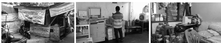
Figure 3. The space shifting with required permission (left & center) and no required permission (right).

The lack of interior space becomes one of the justifications to use the small part of public space for HBE operation, which requires permission from surrounding neighbors to maintain the individual and communal interest towards the public space. 2 of 3 respondents, who practiced the space shifting, were required to obtain permission for their HBE operation from Head of NA. As shown in Figure-3 (left and center),