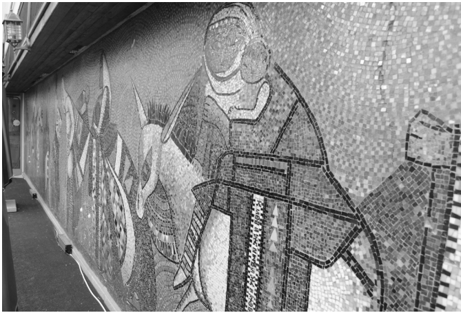
Figure 8. Eren Eyüpoğlu, Composition: Impressions from Anatolia journeys , mosaic panel, IMÇ.

to ignoring the values of the public or the popular majority.