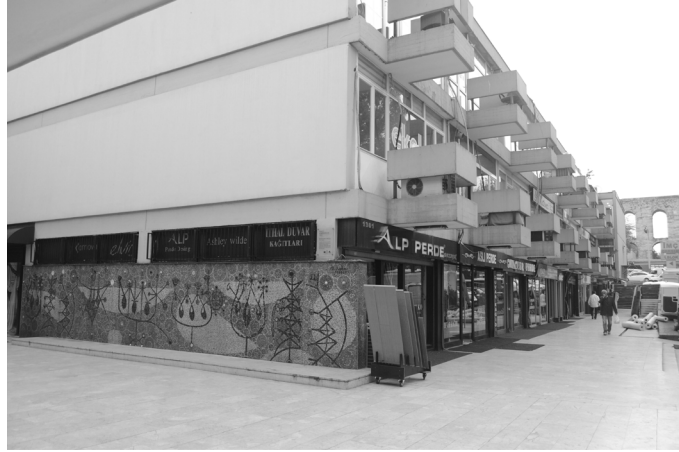
Figure 4. Bedri Rahmi Eyüpoğlu, Abstract Composition , mosaic panel, IMÇ.

In parallel with this concern, architectural debates in Turkey focused on the need to strengthen the dialogue between architecture and society. This 'anxiety' (Golhagen & Legault, 2000:13) about the present state of modern