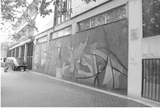
Figure 7. Nedim Günsür, Horses , mosaic panel, IMÇ.