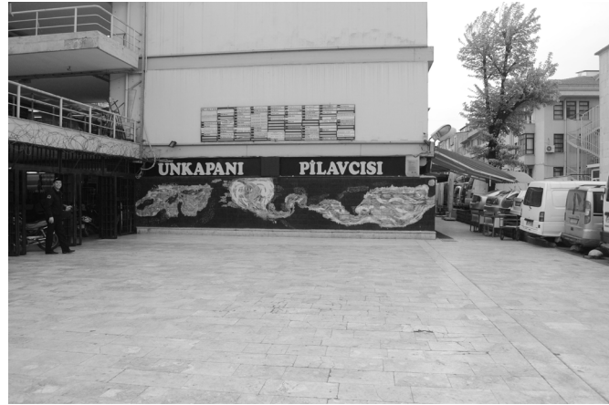
Figure 10. Füreyâ Koral, Abstract Composition , ceramic panel, IMÇ.

composition from the perspective of a person in the street. This determined her choice of forms, particularly the three points that could easily be seen from a certain distance on the street (Kulin, 2012:396) [Figure. 10].