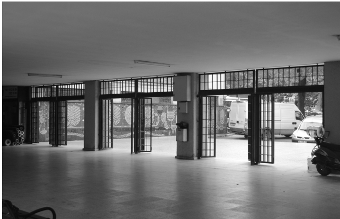
Figure 3. Bedri Rahmi Eyüpoğlu, Istanbul , mosaic panel, IMÇ.

During the postwar years, the architectural debates tried to figure out how to apply the concept of unity and the arrangement of different languages