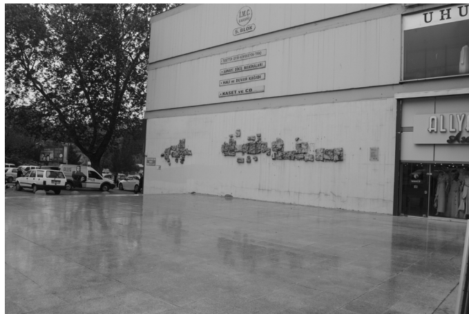
Figure 5. Ali Teoman Germaner, Abstract Composition , relief, IMÇ. Author's archive.