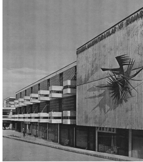
Figure 2. Kuzgun Acar, Birds , metal relief, IMÇ. Reprinted Özcan , N. et al.1969.

10 This is also presented as a preferred scheme by Tapan and Yücel, Batur, Bozdoğan and Akcan while articulating on those years' architectural practices. When considering the indispensable effects of the political system, its arrangements and executions on the general transformation, the postwar years in Turkey used to be divided in two parts in order to better evaluate the facts and ongoing activities in this changed circumstances. This division is made according to the breaking points occurred in 1960 and 1980, both of which refer to the military interventions and the new constitutions in the following.