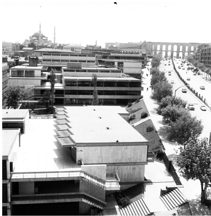
Figure 1. Doğan Tekeli, Sami Sisa, general view of IMÇ. Photo courtesy of SALT Research Gültekin Çizgen archives, code: GCTS0003.

The design of the Complex expressed similar aspirations and decisions. In fact, it has been praised for showing considerable sensitivity to Istanbul's historical silhouette, as every effort was made to integrate it into its surroundings through a 'public-orientated' scheme (Bozdoğan & Akcan, 2012:175). Formed out of a series of small low-rise blocks, and incorporating several courtyards and galleries, the structure occupies a large area in the heart of the city, situated on a large boulevard on the historic peninsula [Figure. 1]. According to Üstün Alsaç (1973:22), it represents a