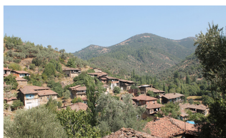
Figure 3. A view from an abandoned village because of human based other reasons: Dereuzunyer Village in İzmir, Turkey. 3

New public or private sector investments such as small or large-scale dams built on rivers, investments in wind and solar energy, unplanned growth of settlements, improper development policies, motorway, seaway or airway investments or public works and urban development activities, are examples of other elements that threaten traditional rural environments (Figure 3).