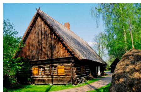
Figure 5: A view from in-situ conserved museum village: Lehde Village in Spreewald Region, Germany. 5

After the adoption of the Geneva Declaration by the International Council of Museums (ICOM) in 1956, the European Open Air Museum Association (AEOM) was established in 1972 to determine international criteria for open air museums. AEOM suggested the protection and restoration of rural buildings in their original environment as far as possible in order to raise the scientific quality of the open air museum approach (Eres, 2016: 162). The notion of preserving cultural assets in their authentic environment began to be accepted with the introduction of modern conservation principles in 1960s. The International Council on Monuments and Sites (ICOMOS) suggested encouraging the open air museums to protect rural buildings in-situ as well in the International Colloquium on Folk Architecture held in 1971. Although the educational roles of open air museums like introducing visitors to the past rural life are acknowledged, it is thought that the approach of bringing different buildings together in a new environment by dismantling them from different contexts is in contradiction with contemporary conservation principles. So it can be said that such museumification approaches cannot be considered as a desirable or sustainable option for the conservation of rural settlements anymore.