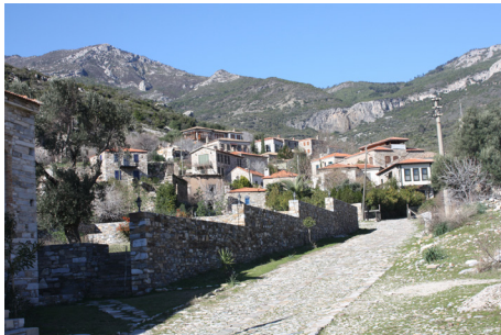
Figure 9: An instance from a rural settlement in which new inhabitants start to live, Doğanbey Village in Söke, Aydın, Turkey. 9

ers, referred to as the neo-rural population, bought abandoned buildings in rural settlements and transformed them according to their own desires. The refunctioning of cultural assets that have been neglected as a result of abandonment can be considered as a kind of rural gentrification by re-functioning by people belonging to the middle and high income groups and a transformation of the past rural fabric into a closed new living environment (Dinçer and Dinçer, 2005: 2). In some cases, this wave of migration from cities to rural areas is in the form of secondary usage like weekend or holiday housing (Figure 9), while in others it leads to permanent settling.