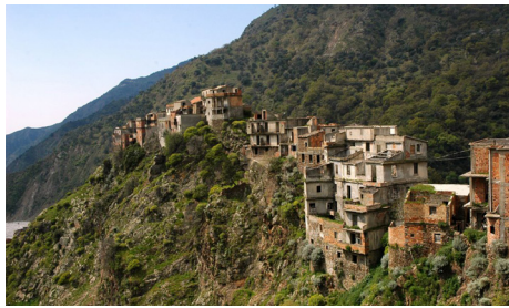
Figure 4: A view from an abandoned village because of nature based reasons: Roghudi Village in Calabria Region, Italy (Italian Ways, 2014). 4

global warming are caused by human activity in the world, they are considered as nature-based reasons in the classification.