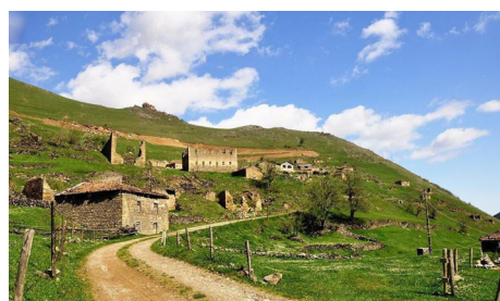
Figure 2: A view from an abandoned village because of politic reasons: Dumanlı Village in Gümüşhane, Turkey. 2

Factors causing loss of population in rural settlements such as wars, conflicts, terrorist incidents, security issues, forced migrations, political discrimination, and racism have been grouped as political reasons. Over the years, many urban and rural settlements have been devastated by wars