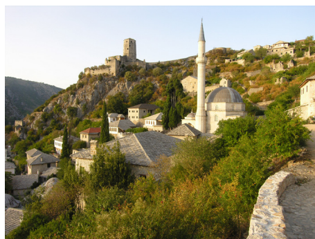
Figure 8: A view from a rural settlement that life restart after war: Počitelj village in Čapljina Region, Bosnia Herzegovina. 8

8 The cultural assets in the village of Počitelj, which is a typical Ottoman settlement with its castle, mosques, Turkish Baths, public kitchens, madrasahs, and half-timbered dwellings, suffered great damage during the Bosnian War (1992-5). After the end of the war, rehabilitation works were carried out with the support of national and international organizations and the life in the village was restarted again.