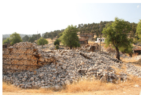
Figure 1. A view of a village abandoned for socio cultural and economic reasons: Sarihacilar Village in Antalya, Turkey. 1

for life in big cities, hopes for a better life or the desire to change social status are grouped as socio-cultural and economic reasons for abandonment of rural areas.