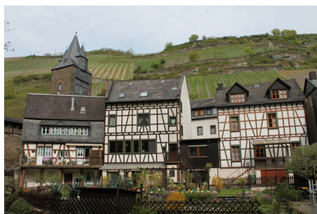
Figure 6: A view from a World Heritage Site where rural tourism developed: Bacharach in Upper Middle Rhine Valley, Germany. 6