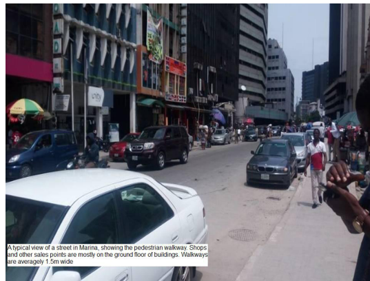
Figure 5. A view of Broad Street adjacent showing pedestrian walks.