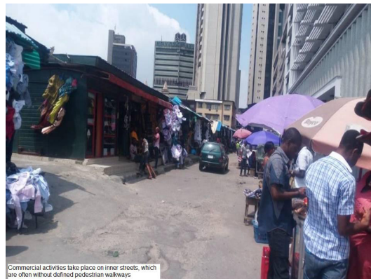
Figure 6. A view of some of the store front (Source: Field work).

sented in Table 4. The experience of traffic jam as perceived by the respondents was significantly influenced by the location of shops on ground floors of buildings ( \beta = 0.501 , p < 0.05 ), directness of pedestrian routes ( \beta = 0.481 , p < 0.05 ) and the sheltering of pedestrian walks ( \beta = 0.158 , p < 0.05 ). Most of the respondents who agreed that they experience traffic jams on the streets of the mixed use developments identified location of shops on the ground floor of mixed use developments, directness of pedestrian paths and sheltering of pedestrian walks as features that impact their movement. The location of shops on ground floors