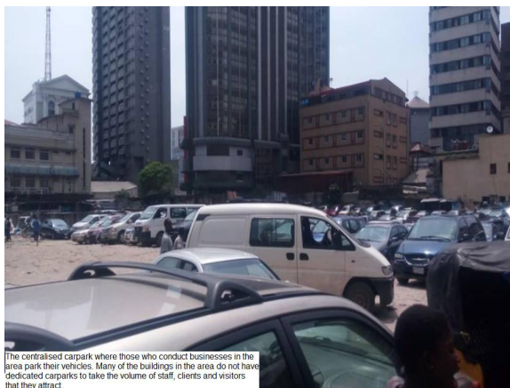
Figure 7. A view of Marina Road showing the existing car park.

The centralised carpark where those who conduct businesses in the area park their vehicles. Many of the buildings in the area do not have dedicated carparks to take the volume of staff, clients and visitors that they attract.