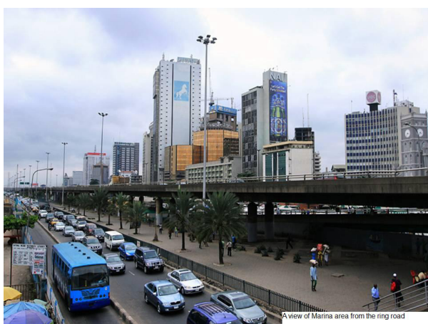
Figure 2. Marina, Lagos, Nigeria (TVC News, 2017).