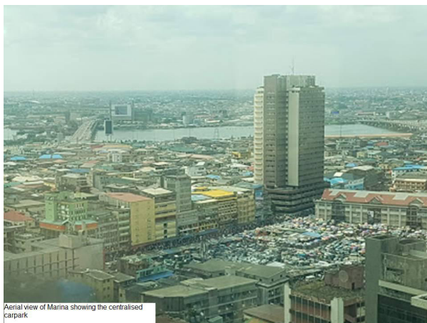
Figure 3. Marina, Lagos, Nigeria, showing central car park.

This could make Lagos City the largest megacity in Africa. Whilst the metropolitan area of Lagos dominates Lagos State, It is important to recognise that the State has important rural areas with agriculture as the dominant activity as well as large tracts of inland water. Lagos has, in the past, been described as a failed city because of the extreme levels of poverty, poor safety